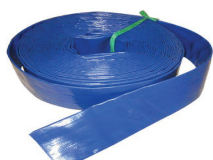
HDH2 , HDH3 , HDH4 , HDH6 Size : 2" , 3" , 4" , 6"