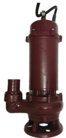
HSW SEWERAGE PUMP